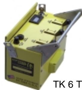
TK 6 Transmitter

CONTROL CHIEF CORPORATION 200 Williams Street, P.O. Box 141 Bradford, PA 16701 1-800-233-3016 814-362-6811 FAX: 814-368-4133 www.controlchief.com